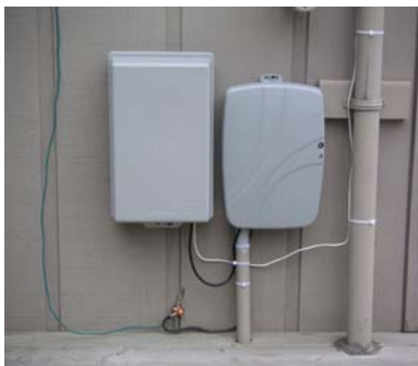
A Typical Installation

Phone: 989-369-9999 Toll Free: 866-500-6799 Fax: 989-369-9998